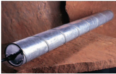
LIDA® Pack Canistered Wire Anode

LIDA® Pack canistered wire anodes are the perfect impressed current anode for shallow vertical and horizontal surface groundbeds, as well as wet, marshy soil conditions where caving is likely to occur.